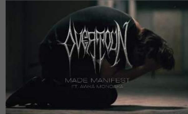
Made Manifest (2021)