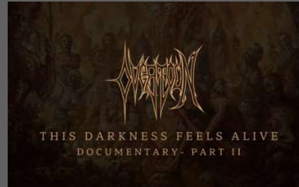
This Darkness Feels Alive Documentary (2021)