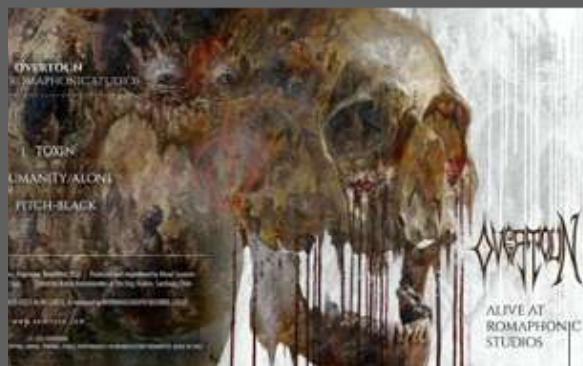
Alive at Romaphonic Studios (2023)