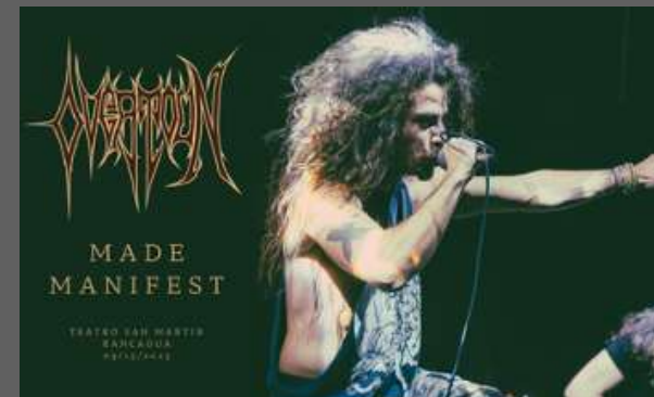
Made Manifest Live (2023)