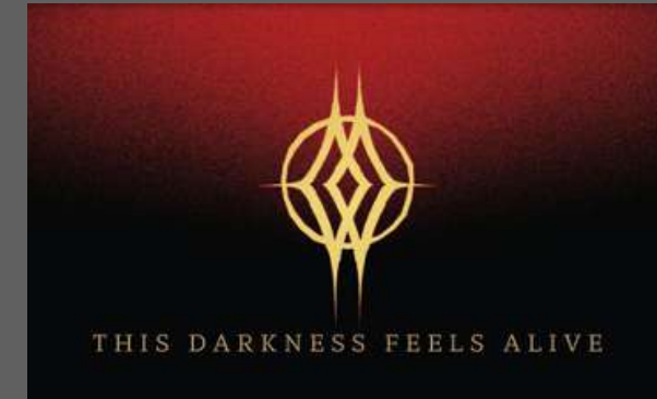
This Darkness Feels Alive Lyric Video (2021)