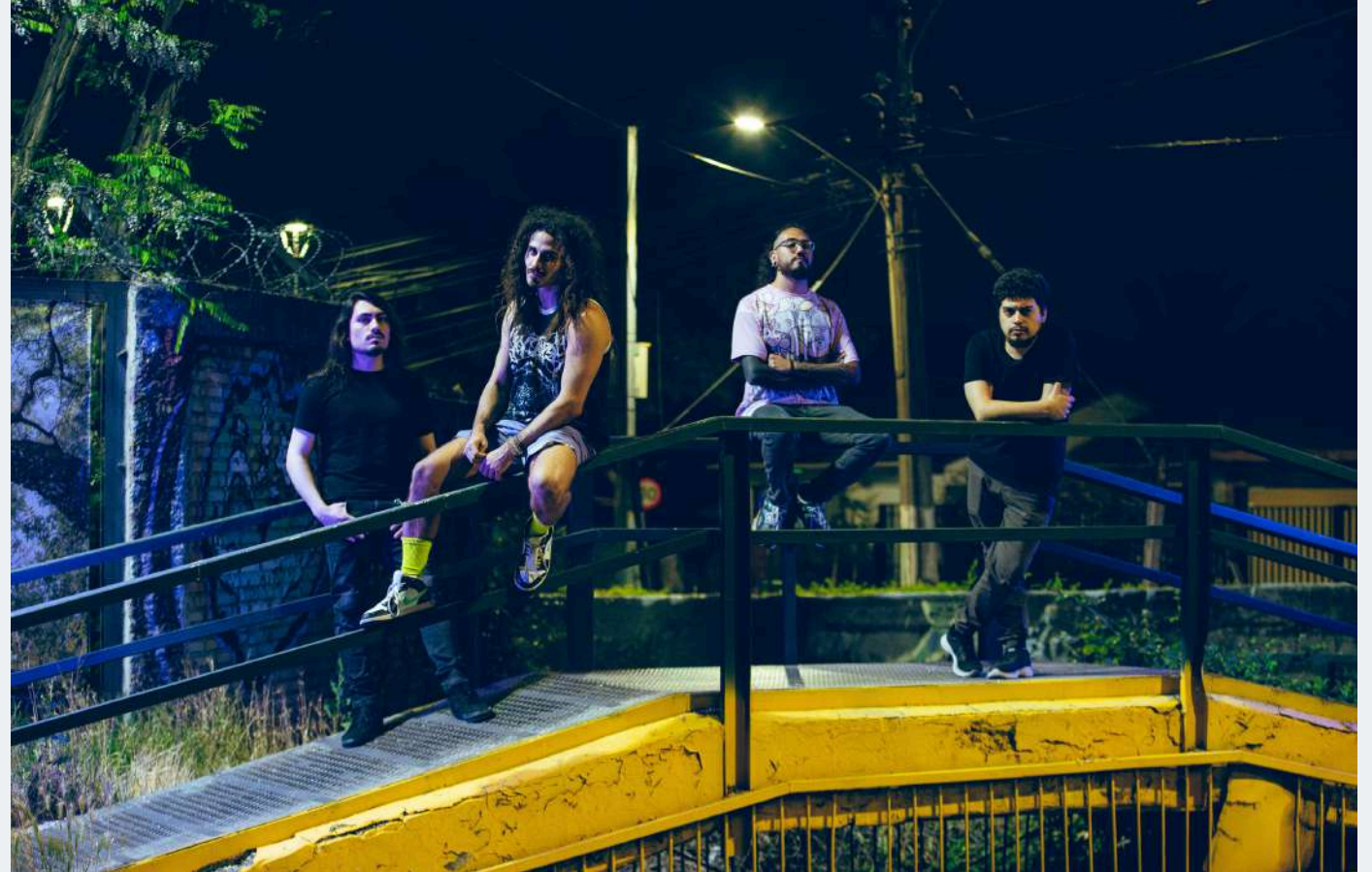
OVERTOUN (2025)

The revolutionary young band from Santiago/Boston has been resurrecting the raw strength and sounds of classic metal while showcasing their talent, passion, and energy from their Latin American roots. They are known for their powerful social commentary and outstanding musical excellence.