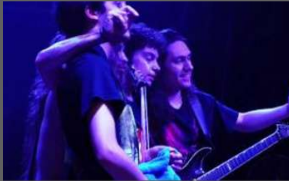
Forsaken Lambs (2019)