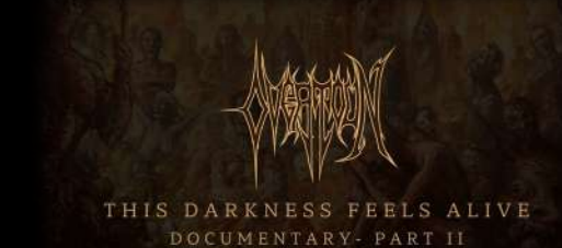
THIS DARKNESS FEELS ALIVE – DOCUMENTARY (2022)